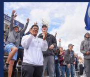
Attend one of the 100+ on-campus athletic events each year.