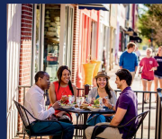
Explore the many cafes, music venues and historic sites of downtown Rome.