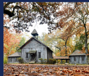
Visit historic Possum Trot Church (circa 1850), "the cradle of Berry College."