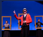
Enjoy a performance at the state-of-the-art Sisters Theatre.