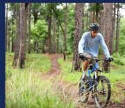
Hike, bike or explore on horseback any of our 80+ miles of trails.