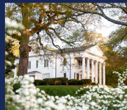
Tour Oak Hill and The Marthas Berry Museum and gardens.